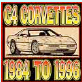
C4 Corvette Art Prints