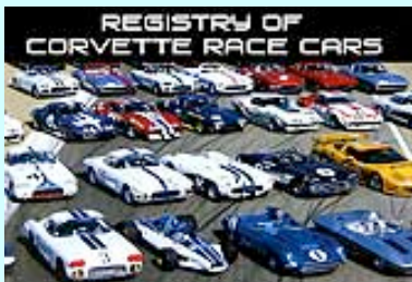
Into Vintage Corvette Race Cars ?