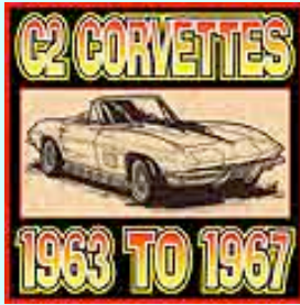
C2 Corvette Art Prints