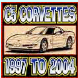
C5 Corvette Art Prints