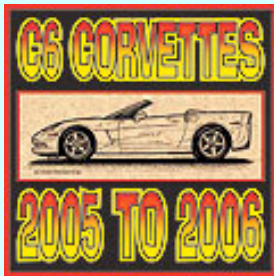
C6 Corvette Art Prints